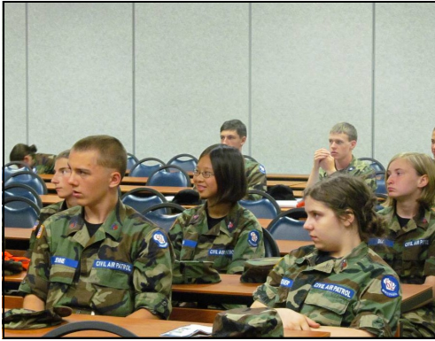
Listening to the Character Development lesson.