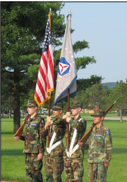
Cadets enrolled in the GLR Cadet Honor Guard Academy present the colors each day.

There are 11 cadets enrolled in the Great Lakes Region Cadet Honor Academy this year. Today the cadets started to develop as a color guard, learning critical skills necessary for being an excellent color guard member. They learned about flag poles and the proper way to hold them; the history of the color guard; the importance of the flag - along with the customs and courtesies of the flag; how to fold the flag and the meaning behind each of the thirteen folds; rifle nomenclature; the color guard competition and proper uniform standards.