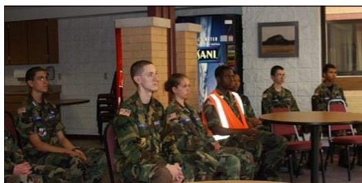
Cadets had the option to attend Sunday worship.