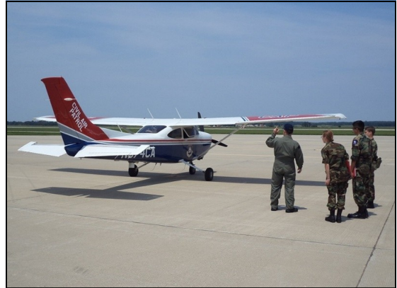
The importance of a proper preflight inspection is demonstrated to the cadets by the pilot.