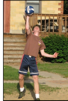
Volleyball fun - a mainstay at encampment.