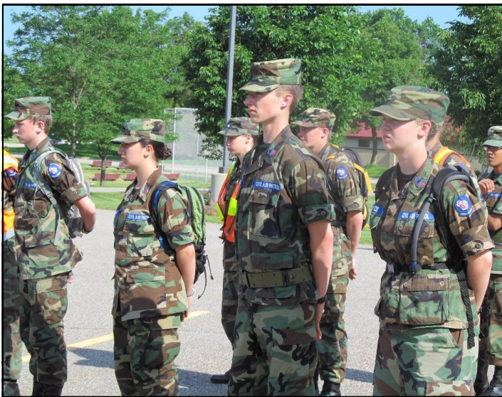
A daily event at encampment, practicing drill and marching will get the cadets into shape for the Pass in Review Parade on Friday.

Everyone knows that learning to deal with stress in one's life is to get moving physically. A good game of ultimate Frisbee not only relieves some of the stress, it develops teamwork and coordination skills. Besides, it is just plain fun! It is a perfect way to end a great day at encampment.